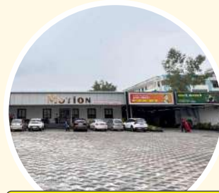
Motion Drona-2 Campus