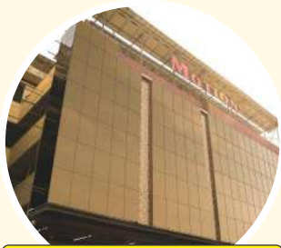
Motion Corporate Office