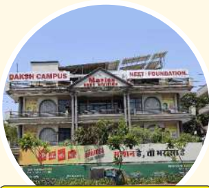
Motion Daksh Campus