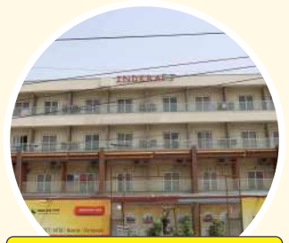
Motion Drona-3 Campus