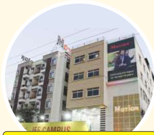
Motion Drona Campus