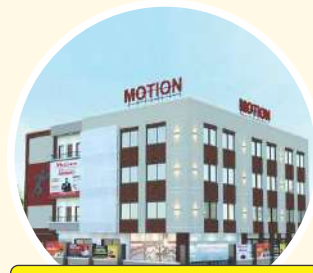
Motion Daksh Campus